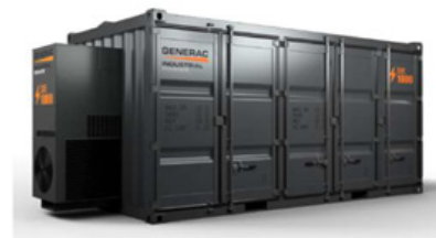
1000 kWh (250/500/1000 kW)