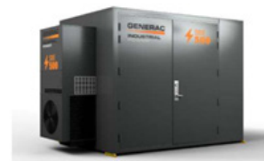
500 kWh (125/250/500 kW)

Battery Energy Storage Systems store excess energy generated by PV systems during peak sunlight hours. This stored energy can be used during periods of low sunlight or at night, ensuring a continuous power supply. Lithium-ion batteries are the most common choice for BESS due to their high energy density and long cycle life. Other options include lead-acid and flow batteries. Battery storage is also prominent for mission critical buildings since they can provide a temporary source of power during a utility outage.